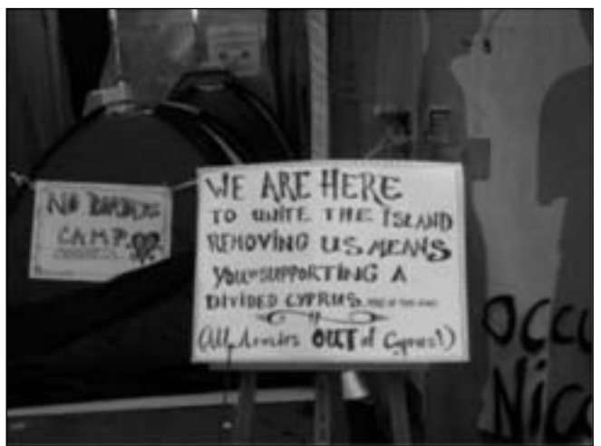
Figure 5: Photograph of a banner from within the OBZ encampment. Statement reads: 'WE ARE HERE TO UNITE THE ISLAND REMOVING US MEANS YOU'RE SUPPORTING A DIVIDED CYPRUS – MAKE UP YOUR MIND – (ALL ARMIES OUT OF CYPRUS!).'