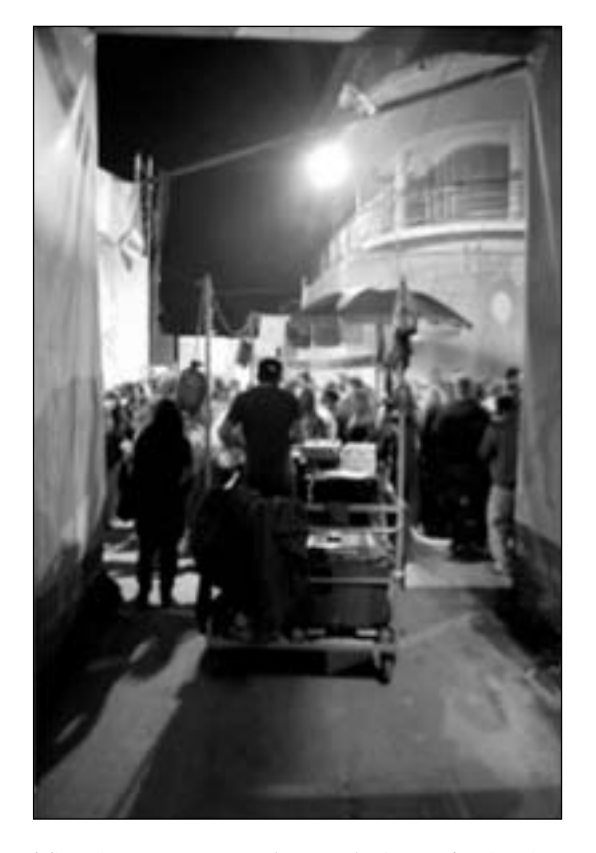
Figure 3: Photograph of the moving platform with the DJ on board and the dancing crowd in front, taken inside the Buffer Zone at Ledras/Lokmaci checkpoint, during the first Nicosia Street Parade in December 2009.

Phaneromeni area and its political character towards a cultural, communal, profile that was open to all. Following this trajectory, 'Street Parade' was the first initiative to actually move inside the Buffer Zone, between the two check-points at the Ledras/Lokmaci crossing, located near Phaneromeni area. The movement of the dancing crowd inside the Buffer Zone offered an intense experience to the participants of the 'Street Parade' and succeeded in actively claiming the space inbetween ; the dead zone. This claiming of the Buffer Zone presented the activists with the critical experience to step forward and proceed to the Occupation of the same spot during the global Occupy movement in 2011–2012 and create the local Occupy Buffer Zone movement.